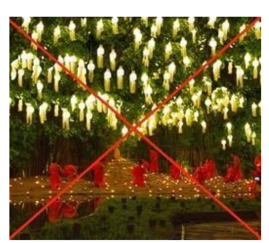
PT 6 e) Noticeable vignettes are not allowed.