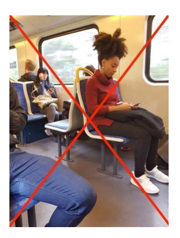
Further information on this subject is available from the Photo Travel's Education page titled 'PTD Competition Corner 1': https://psa-photo.org/index.php?ptd-educational-resources