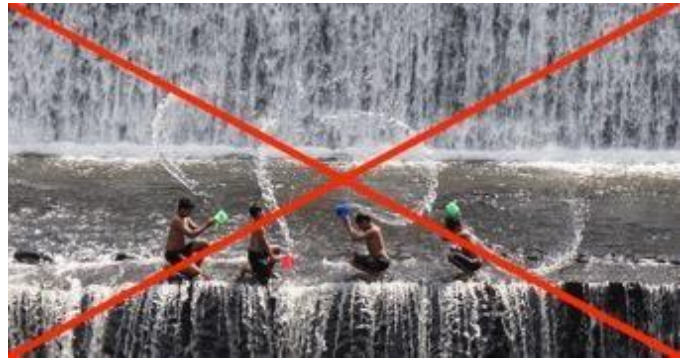
The photo below confirms that the picture of the boys throwing water is a "setup", it is staged.

Set-ups can be identified when many images of the same or similar scenes are submitted to exhibitions, or when they depict unnatural actions or behavior by the people shown in the photo.