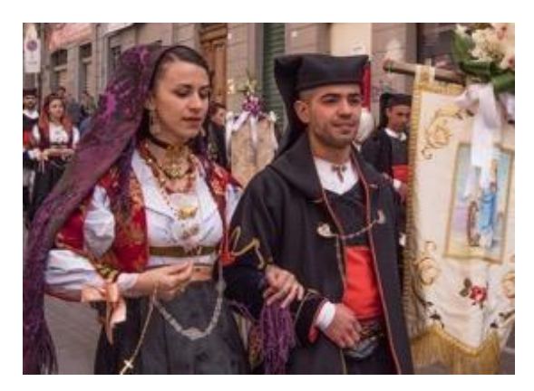
There is further reading on close-up images on the Photo Travel Education page: <a href="https://psa-photo.org/index.php?ptd-educational-resources">https://psa-photo.org/index.php?ptd-educational-resources</a>