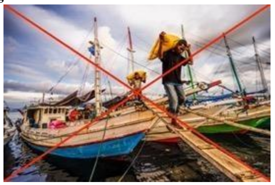
PT\ 6\ c) Over-sharpening where unnatural artifacts appear such as halos should be scored low.